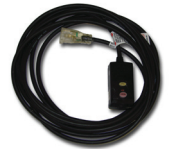
GFCI Charge Cord